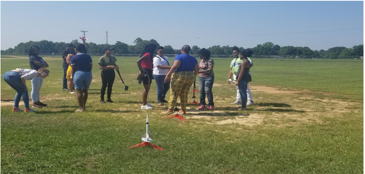
Upward Bound students built and launched their own high-flying model rockets.