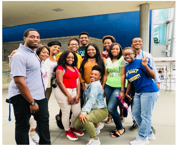
McNair students and staff having fun in the evening after attending the SAEOPP McNair/SSS Research Conference in Atlanta

college student he thought he might become overwhelmed. Now in his junior year, the Valdosta native chose biology and plans to pursue an M.D./Ph.D. degree specializing in pediatrics thanks to the benefit of being a McNair Scholar.